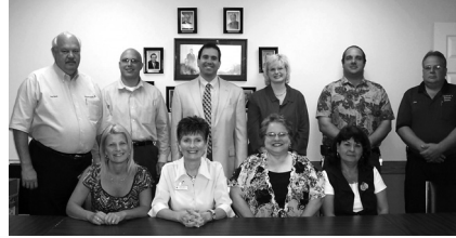
Some of our C.A.R.E. members

The Norwin Chamber of Commerce is excited and proud to announce that the C.A.R.E. (Chamber Associates Referral Exchange) Group is celebrating its ONE YEAR